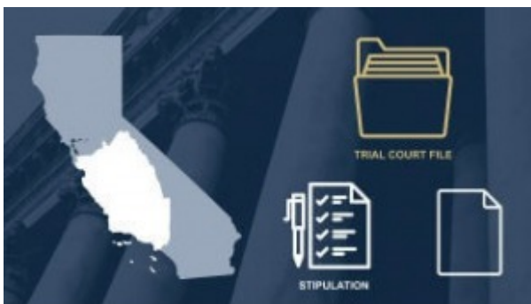
Video: Designating the Record for Appellants, 15:51