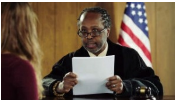
Vídeo: Preserving the Record on Appeal, 5:33

Watch a step-by-step video on how to designate the record on appeal.