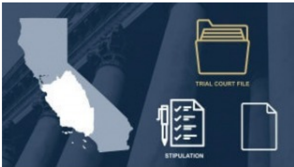
Video: Designating the Record for Appellants, 15:51