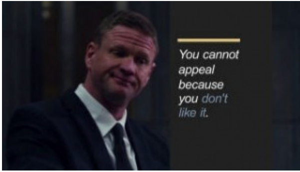
Video: To Appeal or Not to Appeal, 6:29