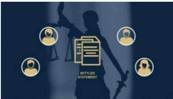
Vídeo: If you Can't Get a Reporter's Transcript, 5:18