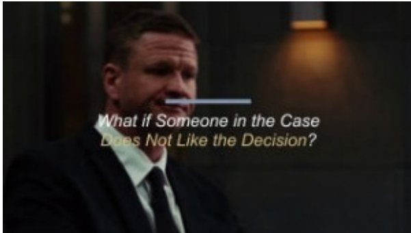
Video: Judicial Branch Overview, 8:00