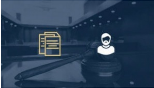
Vídeo: What is a Brief?, 4:27